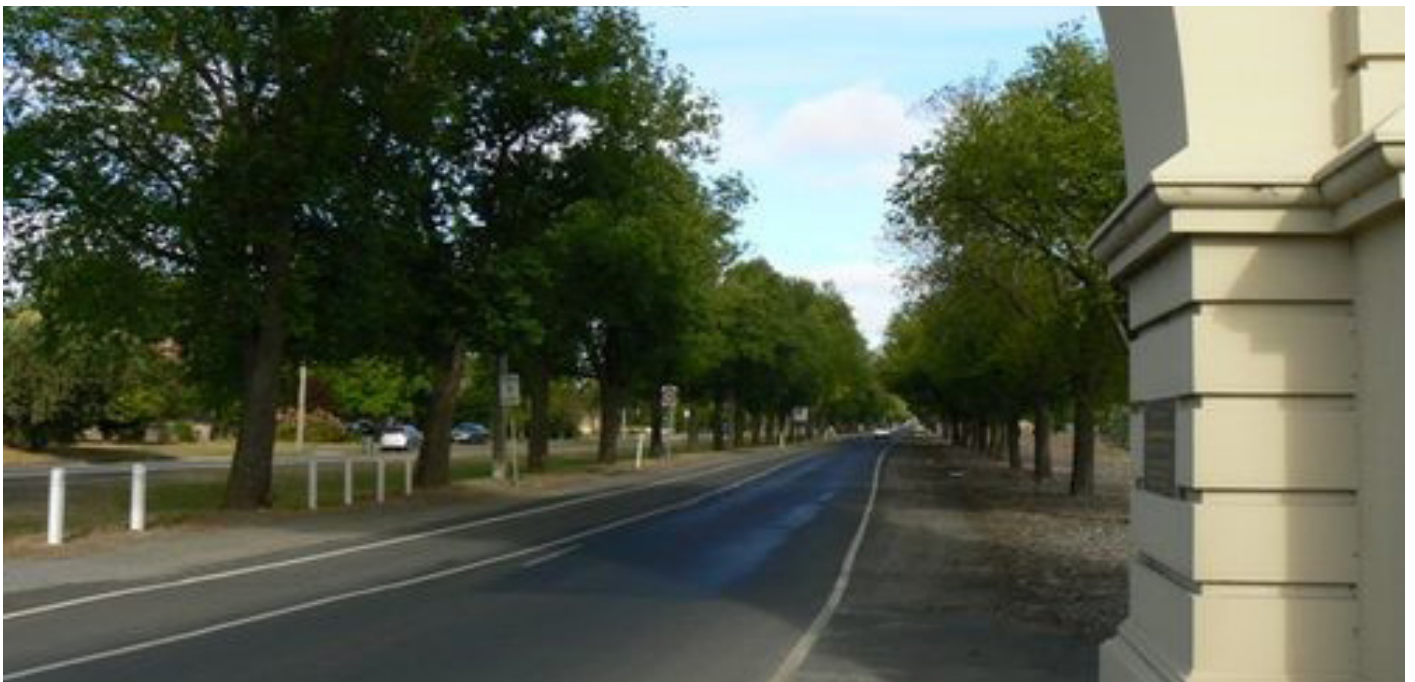
Avenue of Honour, Ballarat

For example, every war brings immense suffering, death, pain and grief. But we have learned to accept it, and in time it serves as a memory of honour and an inspiration for us to care for one another. The Avenue of Honour in Ballarat is such an example. Today, it serves to ignite pride and respect for the ANZAC spirit.