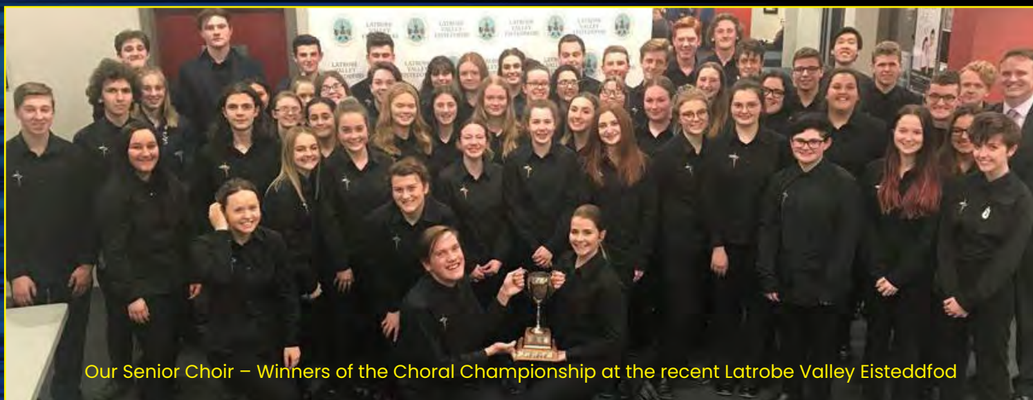
Our Senior Choir – Winners of the Choral Championship at the recent Latrobe Valley Eisteddfod

Thanks again everyone, best of luck to our year twelve students who are in the final throes of preparation for the recital exams throughout October.