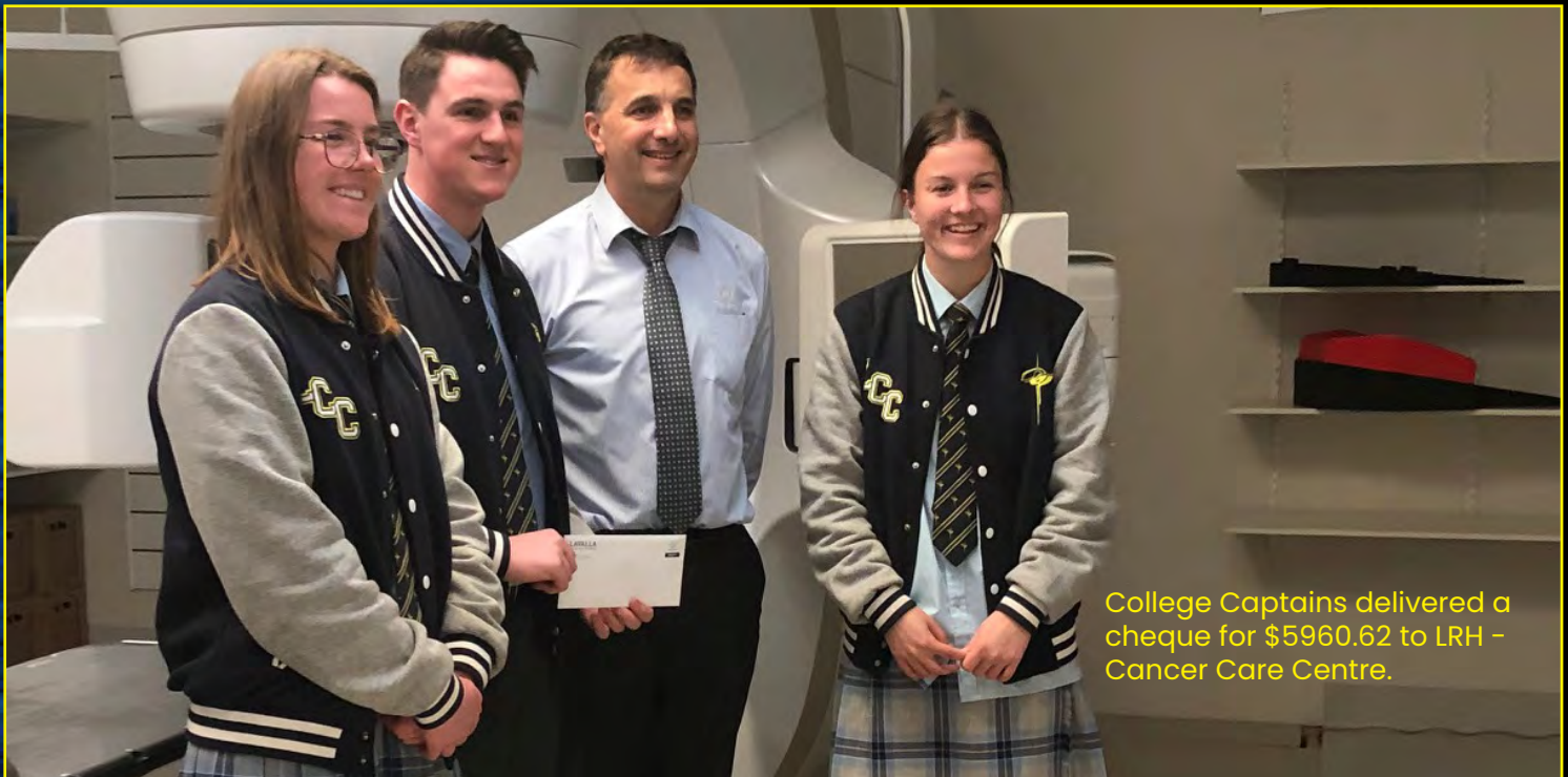
College Captains delivered a cheque for $5960.62 to LRH – Cancer Care Centre.

On Friday 13th September, all students at Kildare campus had the opportunity to participate in R U OK activities. The activities included 4 Square, Chalk Drawing (messages of hope, support and positivity), theatre sports, board games, basketball, dodgeball, movie watching and meditation. These activities enabled students to interact with each other, check in and have the opportunity to relax at this busy time of the year. It was great to see the smiling faces on staff and students alike. While recognising RUOK day is important, it is even more important to ask each other, each day RUOK. Listening is the first step to helping.