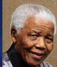
Nelson Mandela Former President of South Africa (Born 1918)

We must use time wisely and forever realize that the time is always ripe to do right.