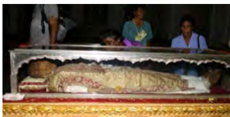
Left: Francis Xavier: Cathedral of Bom Jesu, Goa.

In 1541, Xavier was sent on mission to the Portuguese colonies in the East. Based in Goa, he established missions in Melindi and Socotra (Africa), Goa (India) and the Moluccas (Indonesia). In 1549, he began the first Christian mission to Japan. Refused entry into China, he succumbed to severe illness and is buried on an island off Canton. His body was buried there but later brought to Goa, where it is kept in a silver casket in the cathedral of Bom Jesus.