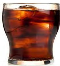
250ml soft drink