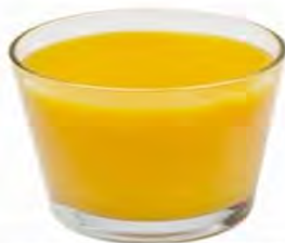
250ml fruit juice drink