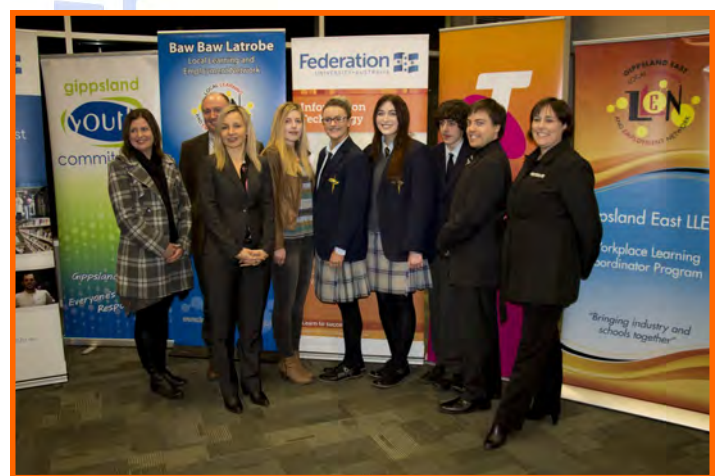
Students from Lavalla took part in the GippsWeb for Business Competition. The Lavalla team came first in the Competition and are pictured above with representatives from Telstra, Federation University and LLEN.