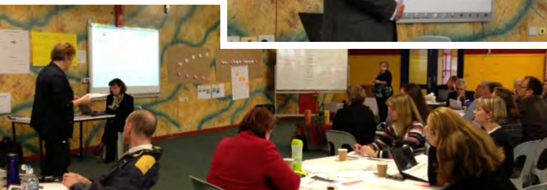
Staff from Catholic Schools across the Diocese of Sale at the Literacy in Action Conference on 29 and 30 August at Presentation Campus Moe