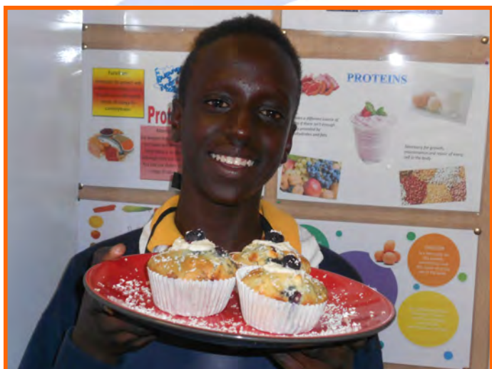
Year 7 2015 Twilight Evening

'I found that it really was a great experience to meet the influential women in our community and to listen to the advice of someone who knows what they are doing and who has been in my position before. Over the course of the dinner we were given a chance to really think where we want to go in the future and to consider where the past 13 years of schooling could take us. I would recommend to anyone that has the chance to attend this dinner does so as it truly is a really great experience and an opportunity worth taking.'