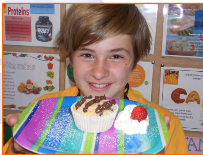
Year 7 2015 Twilight Evening

Congratulations to all participants and all the very best for your studies in Geography over the next few years.