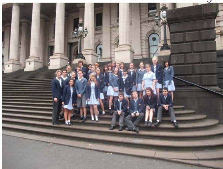
Year 12 Legal Studies Excursion March 2011