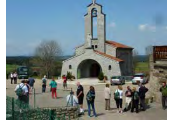
Le Rozey Church built in honour of St Marcellin Champagtnat's memory

The building is on schedule to be completed by next week. We are aiming to inhabit the building