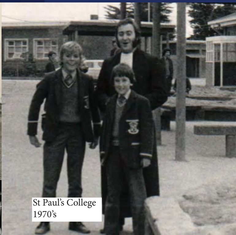
St Paul's College 1970's