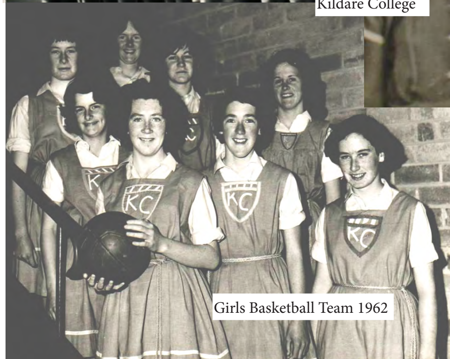
Girls Basketball Team 1962