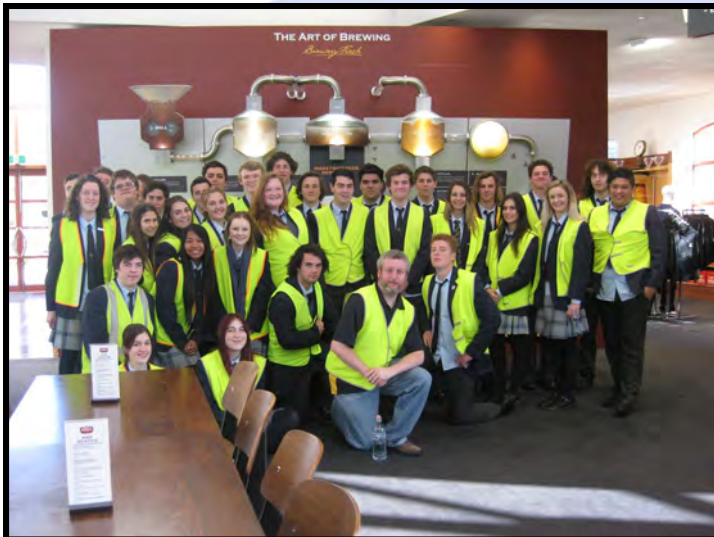
Year 12 Business Management Students at the Carlton United Brewery

Back in the classroom, the students are now preparing detailed reports on the key knowledge areas from their VCE study design and applying them to both companies. This will be an outstanding resource in their preparation for their final exam in November.