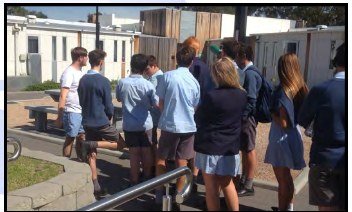
Years 10 & 12 Students finding out about accommodation options at Federation University