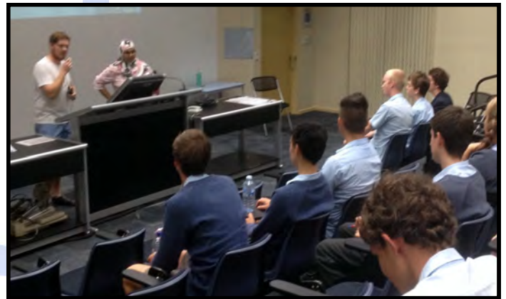
Years 10 & 12 Students sitting through a Lecture at Federation University