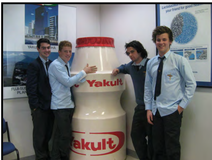
Year 12 Business Management Students at the Yakult Production Facility