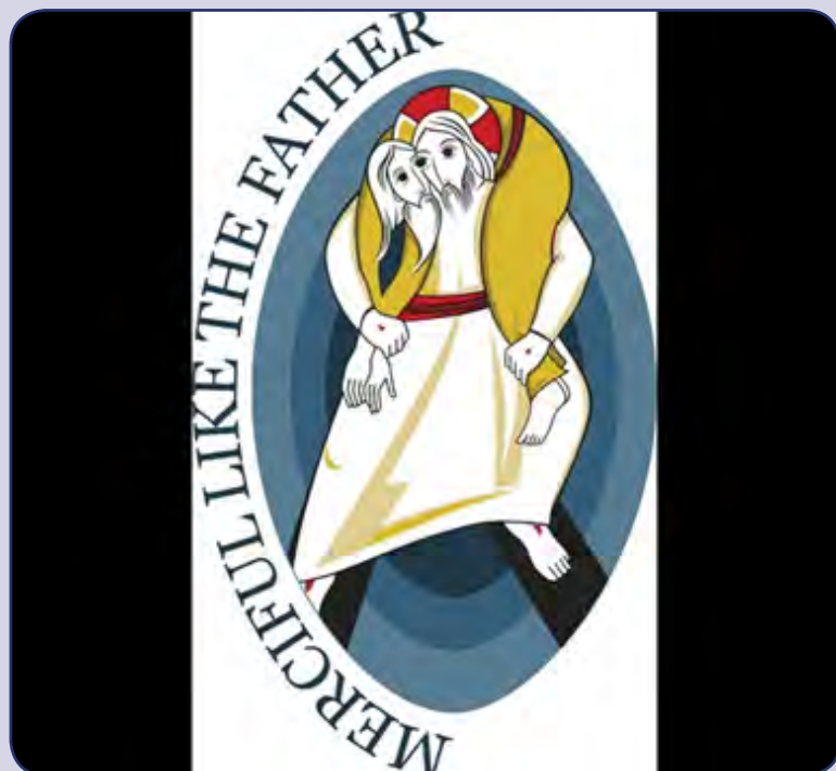
The Official Logo of the "Holy Year of Mercy"

The Blue Caravel, 10 students and two teachers, are looking forward to a four day solidarity camp in Melbourne from 1st -4th December. They will stay together for the four days in 'The Nunnery', cooking and looking after themselves. They will do community service in the Primary school, the House of Welcome, the Soup Vans and the exodus Community.