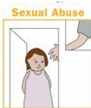
Behaviours that Make You Feel Bad or Embarrassed

Sexual Offences – Words and actions that happen against you that are illegal or that make you uncomfortable (such as sexually revealing words, unwanted photos, touching).