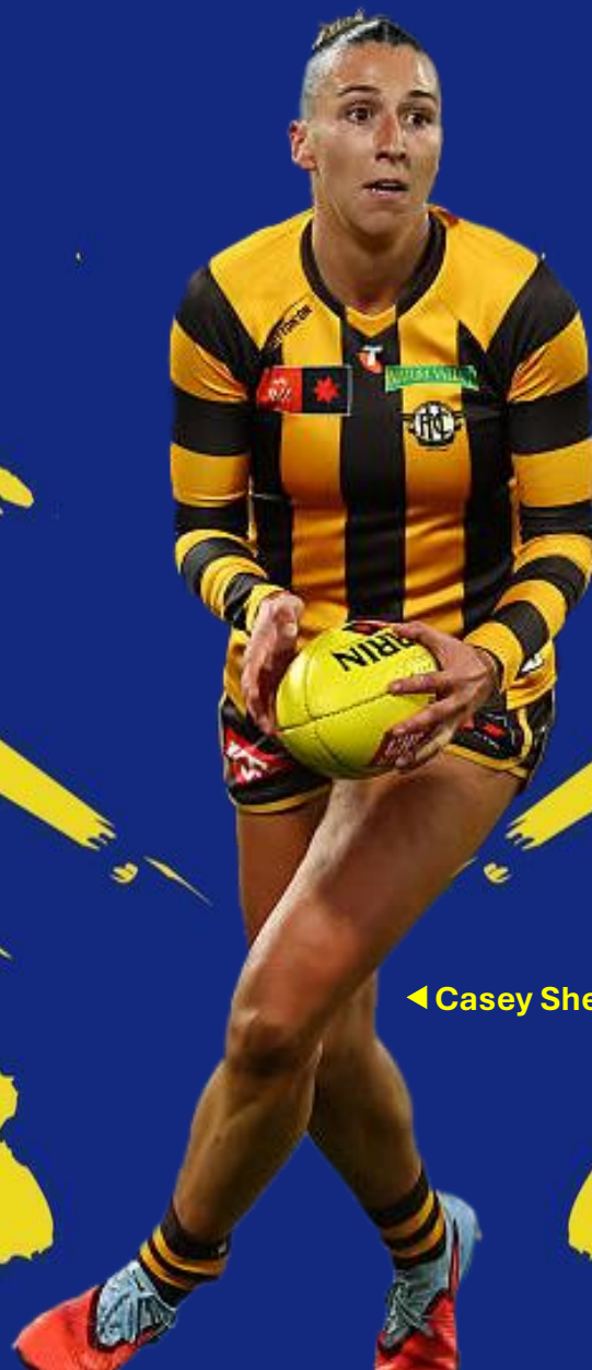
◀ Casey Sherriff